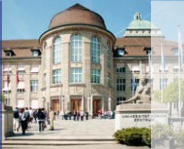
University of Zurich Switzerland

Integrating research and education in the curriculum is a primary objective at UZH. The degree programmes offered not only attest to the University's academic excellence, but also reflect its focus on research-based teaching: all UZH programmes of study place great value on engaging UZH students in individual research at an early stage in their careers.