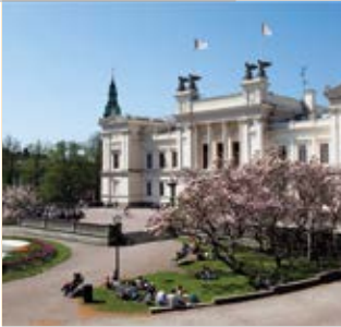
Lund University Sweden