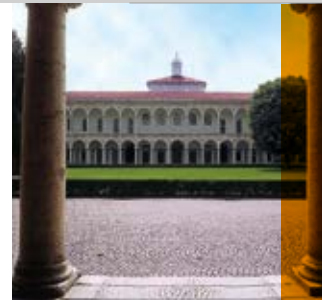
University of Milan Italy

In recent years degree programmes entirely or partly taught in English, as well as joint and double degrees, have multiplied, as part of a wider process of internationalization.